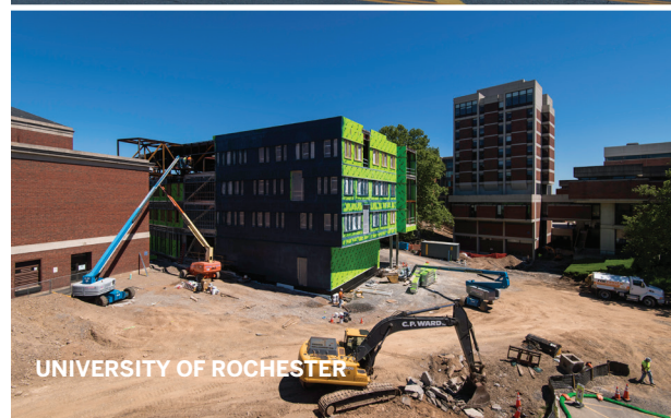
UNIVERSITY OF ROCHESTER